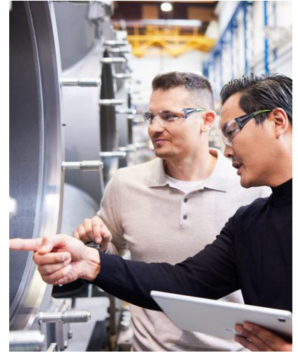
Working as partners is essential.